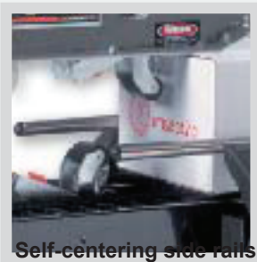
Self-centering side rails

Little David delivers packaging equipment that works for you