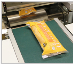
Food in printed film