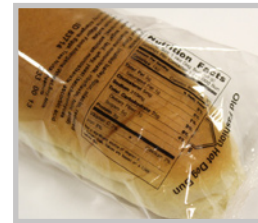
Thermal print nutritional information