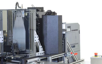
Continuous Print System verifies, folds and inserts Lit Packs

The Script Pack SPrint features field-proven components integrated into a complete pharmaceutical fulfillment system. A command center monitors and records each step of the packing process, and provides comprehensive productivity reports. This system is supported by technical phone support to keep it running at peak performance, features remote diagnostics capabilities, and is backed by the industry's largest field service organization.