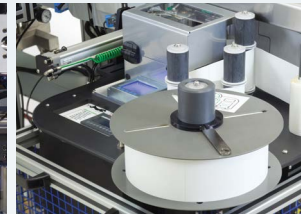
Shipping label is automatically printed and applied to bag