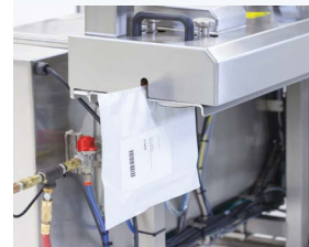
Labeled, loaded bag is automatically sealed as it exits the bagger