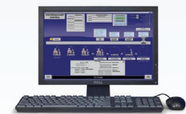
The command center tracks and reports every step of the packaging process