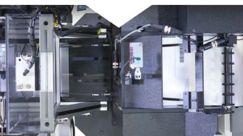
Multi-layer verification ensures order accuracy