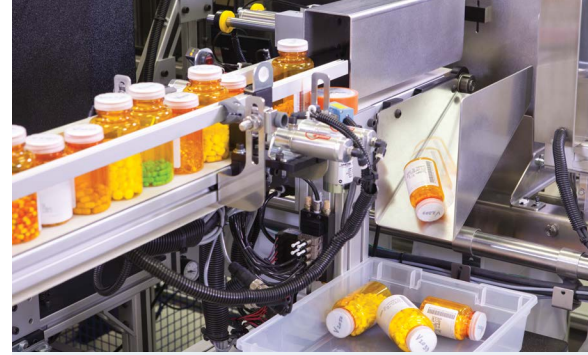
Incomplete or mismatched orders are diverted to a reject bin