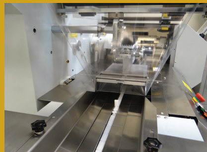
◀ Delicate product conveyor with carrier card in-feed guide rails to handle product transitioning to the custom fixed former.