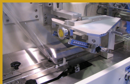
◀ Deluxe Adjustable Former provides an improved film flow, similar to a fixed former while maintaining versatility