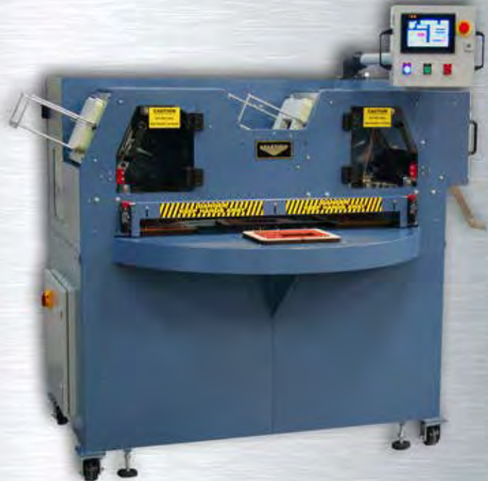
FAB4-1012 shown with optional casters